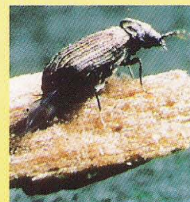
Wood Boring Beetle